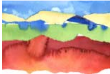
Landscape. 10x7. watercolor collage. 10.30.03

while teaching an Introduction to Watercolor class at the Botanic Garden in April, NAN discovered a new way to Make Art by experimenting with watercolor and collage. First, you try all the watercolor