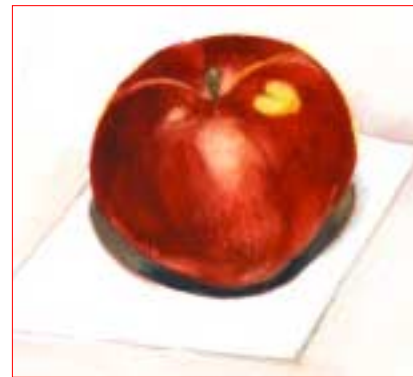
Apple with a Heart.5.27.05