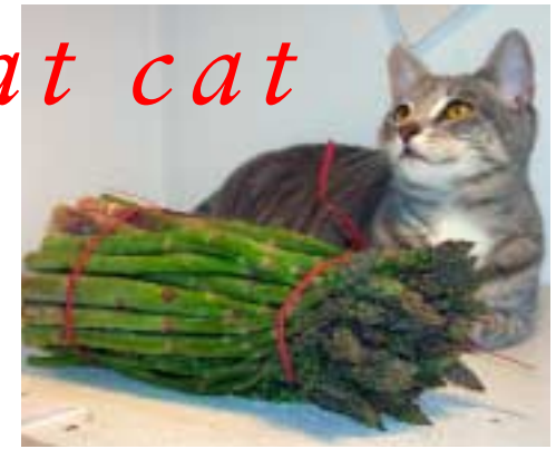
Cat and asparagus, 2005